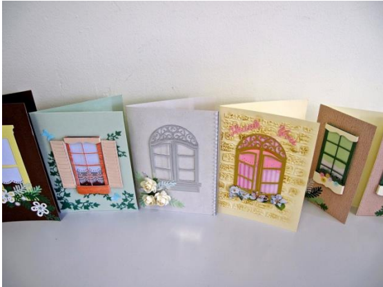
The Craft and Cards SIG showcase their talents