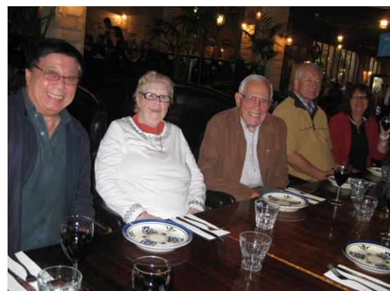
Enjoying lunch at the Sicilian Restaurant