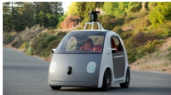
Example of the self-driving car proposed by Google

http://www.npr.org/templates/transcript/transcript.php?storyId=316486989