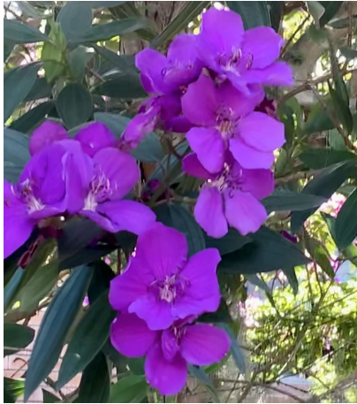
Photo: View from my window.