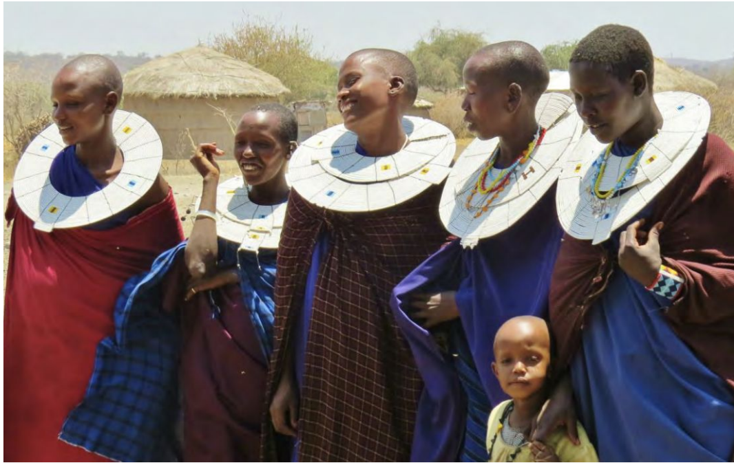
“Mystical Masai Dancers” First Place - Travel Photo - Hazel Labka