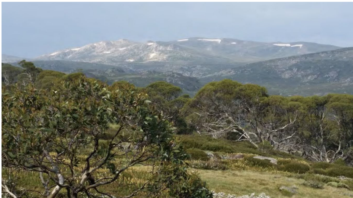
“The Scene from Snowy River” Highly Commended - Landscape - John Hain